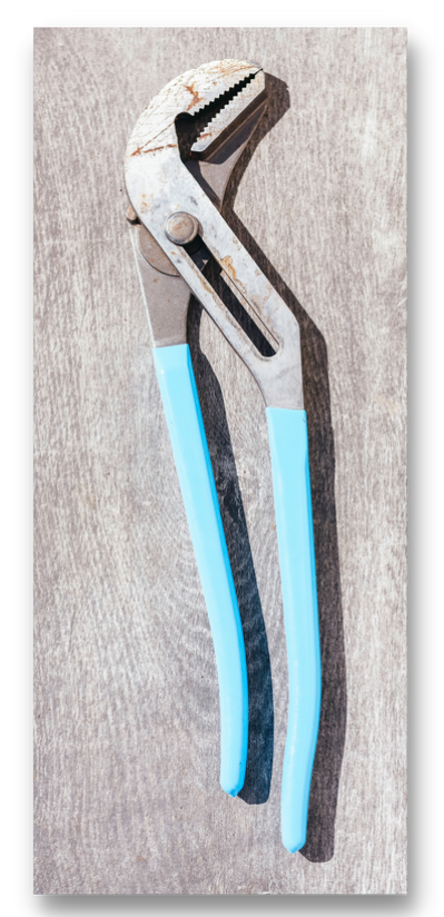
Tool Needed: Channel Lock (20 inches or larger)

If you have a Paramount or A&A Delta UV disconnect plumbing connection union with a channel lock (20 inches or larger) at the bottom of the UV like the photo below.